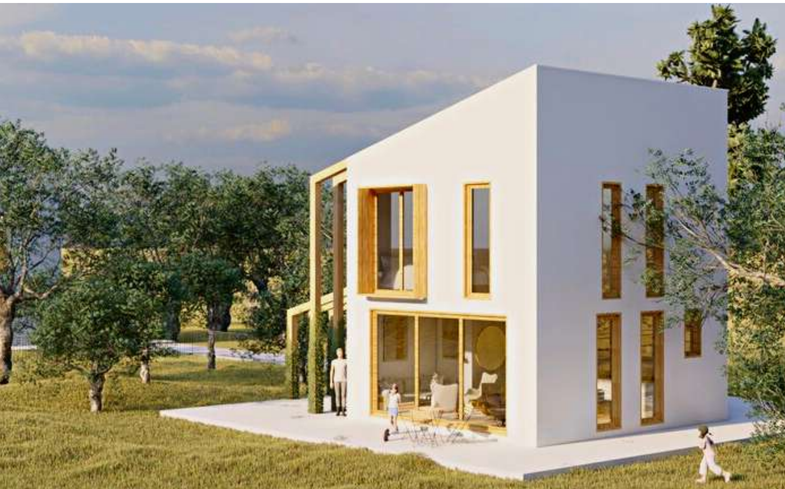
3D design of the 2 bedroom Tiny House

We are a property developer in Montenegro since 2008, first introducing the concept of tiny living in Montenegro back in 2016.