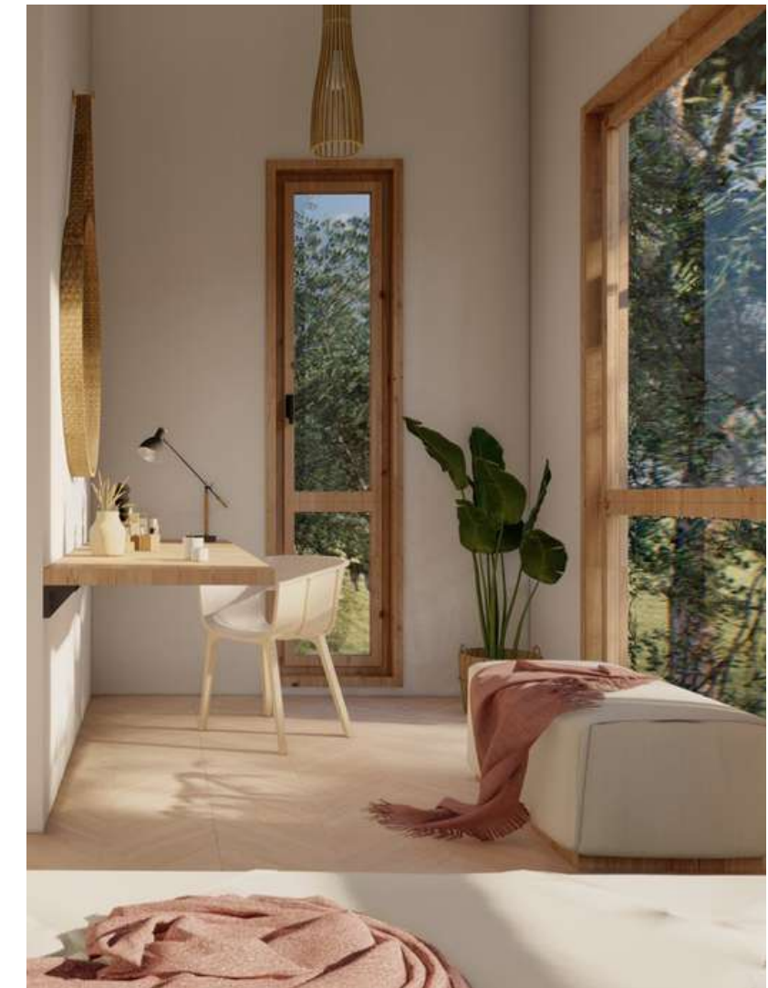
Tiny House, bedroom design