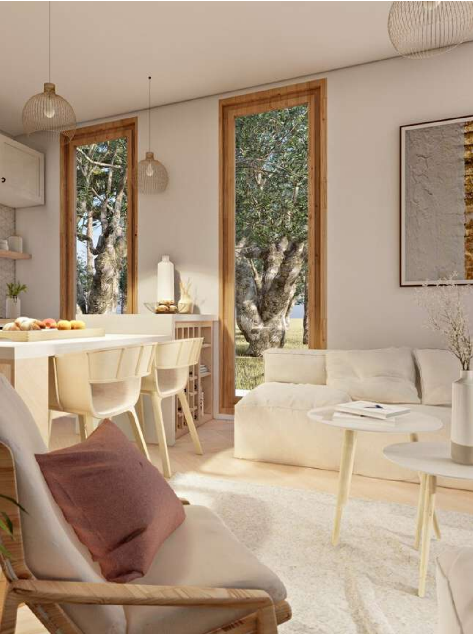
Living/Dining area Tiny House