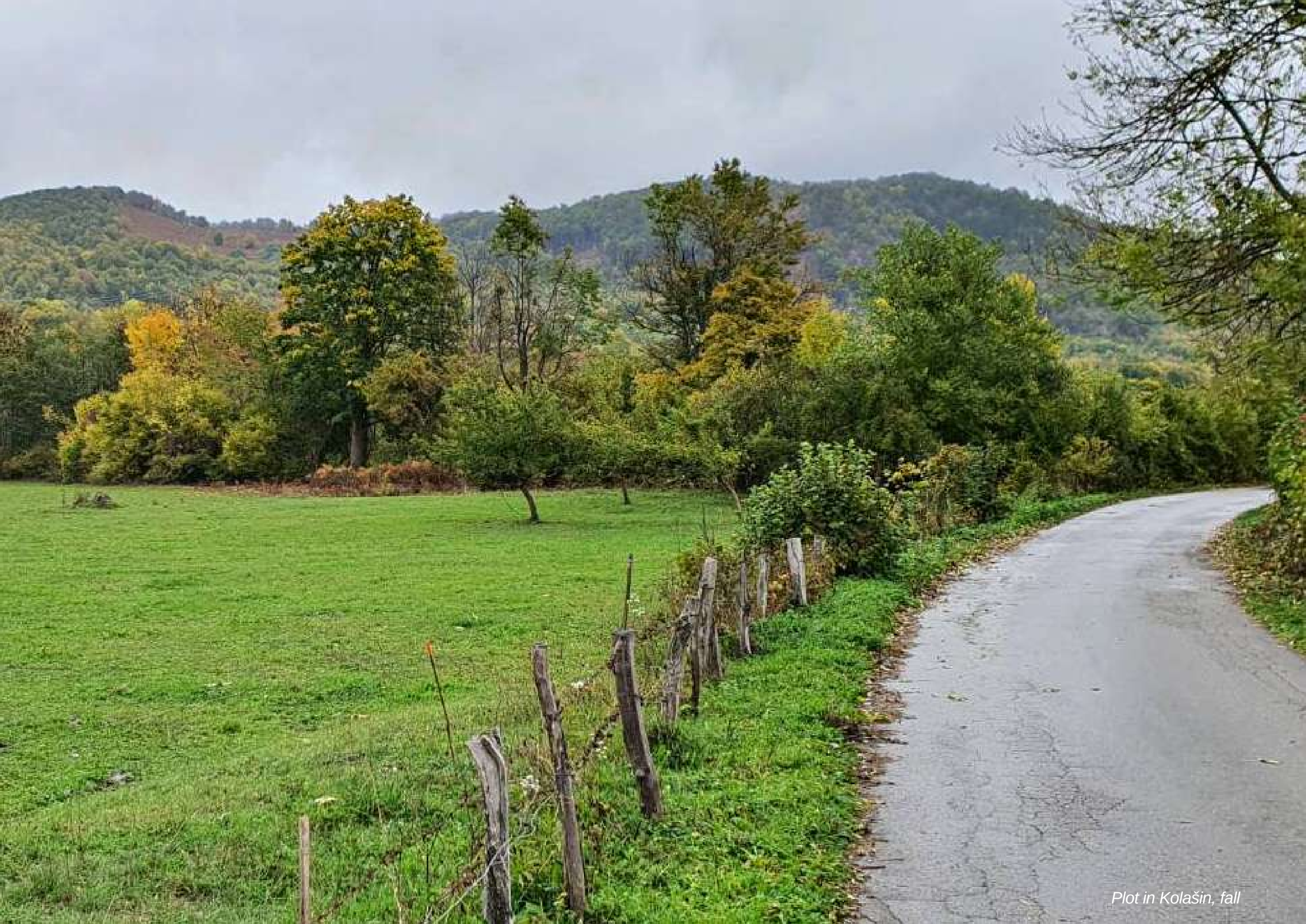
Plot in Kolašin, fall