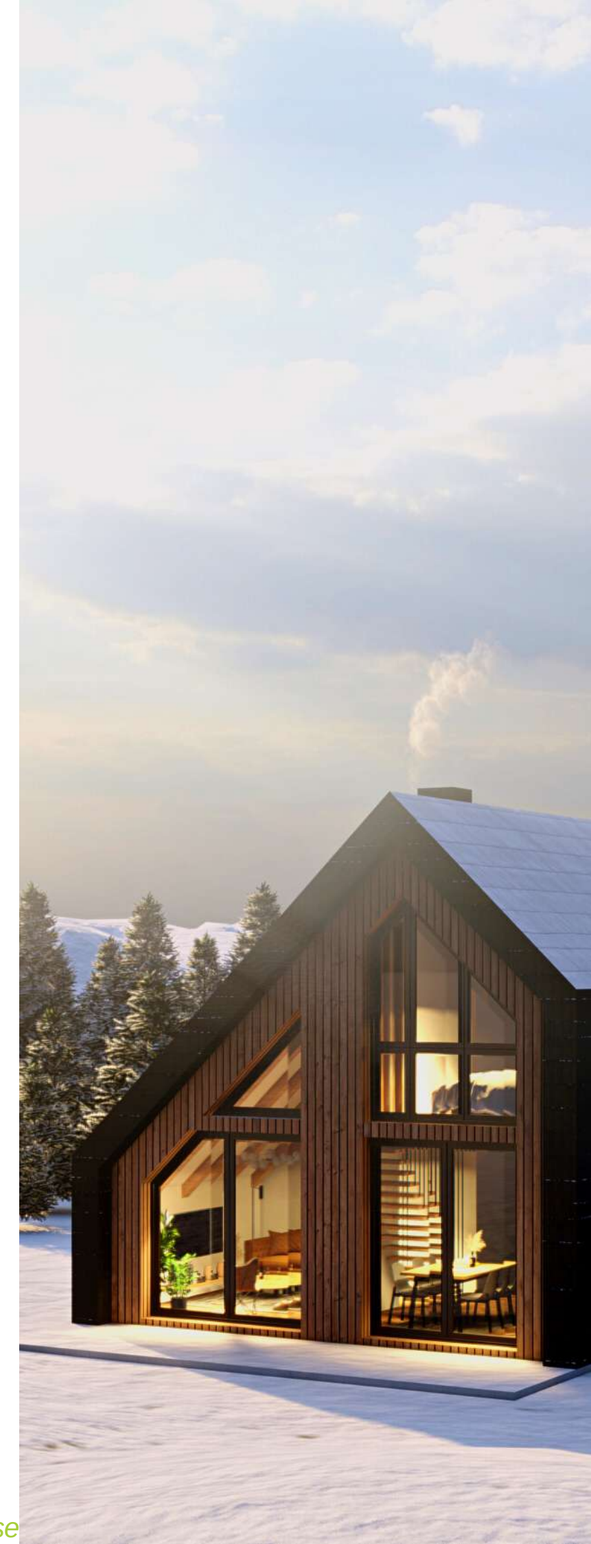
3D design of the 2 bedroom Tiny House

Your Tiny House comes with its permaculture garden to produce organic veggies and herbs. You can enjoy the best quality harvest thanks to the Mediterranean and mountain climates. We also offer free training at the permaculture education center in the nearby Bay of Kotor so you can learn how to properly maintain your garden.