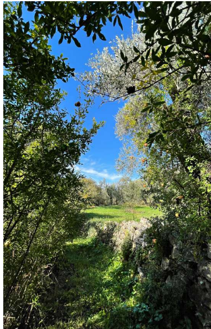
Plot in Kavač, The Springs, fall

At 120m of altitude, the houses benefit from a mix of sea and mountain pure air. Also many hiking trails are starting right next to the land.