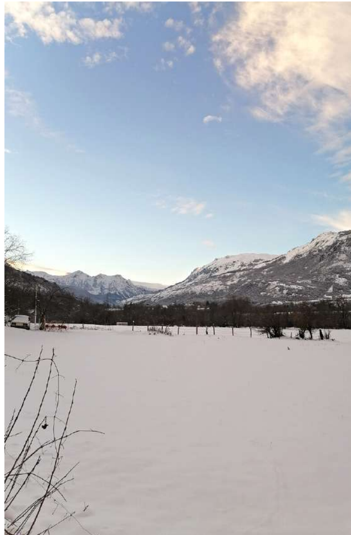
Plot in Kolašin, winter

With the new highway connecting the north of Montenegro to the coast. Kolasin presents a strategic location as a ski resort connected to the capital city in less than 30min and the sea in 1h.